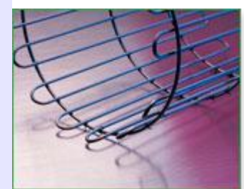
Heating wire, rods