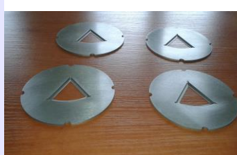
Turned and milled parts